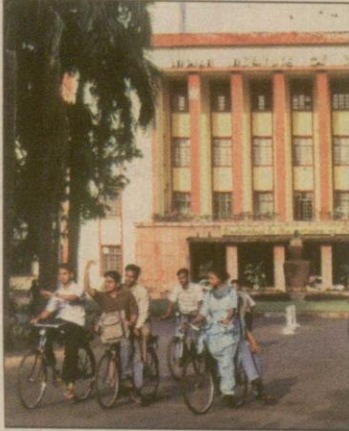
■ Students of IIT-Kharagpur