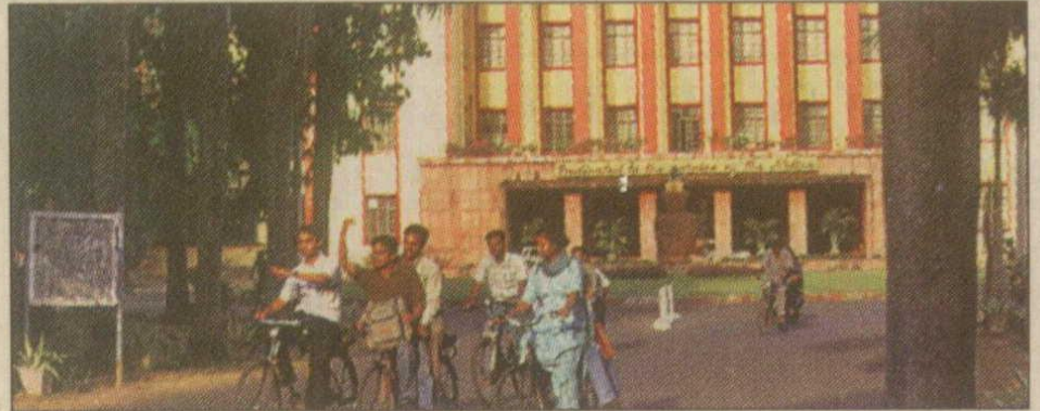
■ Students at one of the IITs.

As per the OECD report 'Education at a glance' 2010, the faculty-student ratio in higher education institutions was 15.1:1 in US, 17.6:1 in the UK, 10.6:1 in Japan, 12.1:1 in Germany and 16.6:1 in France. In IITs, the